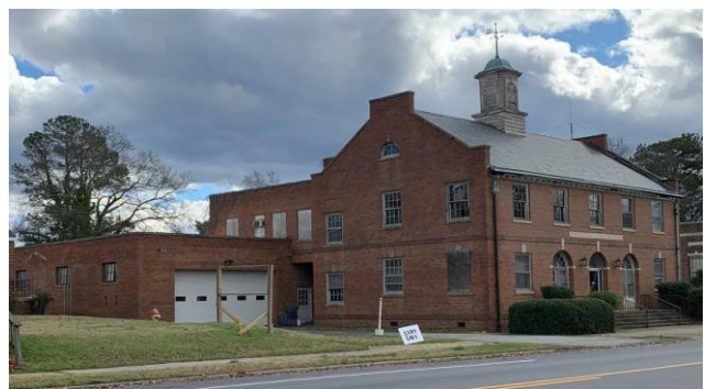
Subject Location 632 Roanoke Ave. (former City Hall & Police Station); photo taken by Planning Staff

The property at 632 Roanoke Avenue is the subject of the Special Use (Conditional Use) Permit Application. The property is developed as a two-story commercial building that formerly housed the City's Police Department and Administrative Staff. The site has a B-1 Commercial District Zoning Classification.