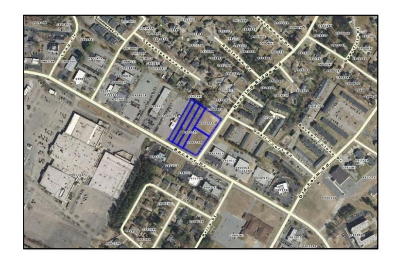
FIGURE 1 PARCEL MAP PROPERTY LOCATION